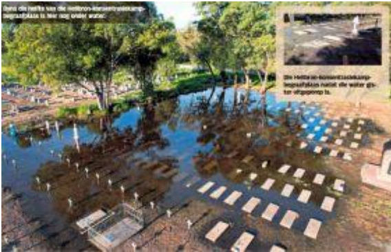
The Heilbron Concentration Camp Churchyard is under water. In the inset photo, the water was pumped out