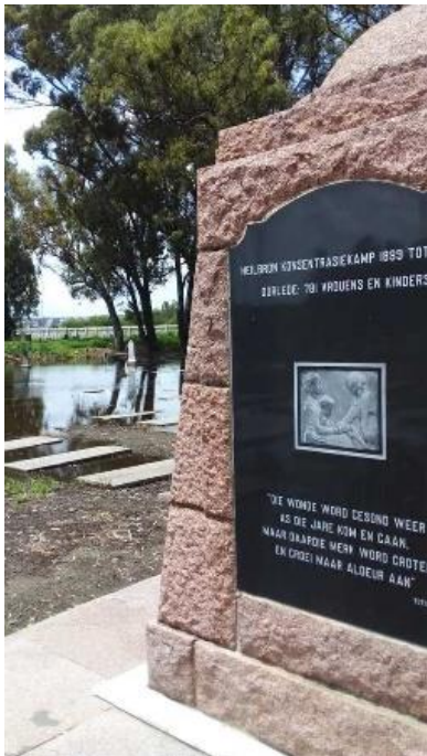
The memorial at the cemetery. Can also be seen at the right can of the top photo

The wet soil causes the tombstones and concrete blocks to sink even deeper. "The ground basically consumes the graves.