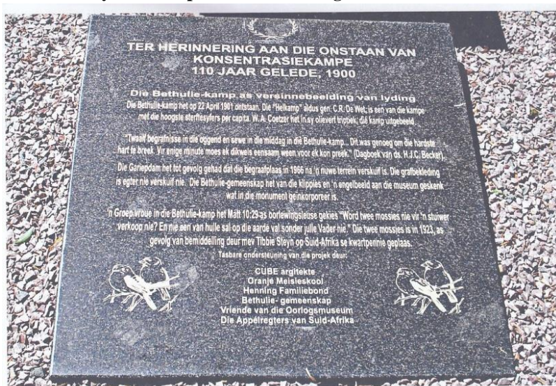
The Memorial tablet at the Concentration Camp Memorial at the War Museum, Bloemfontein where recognition is given to the contribution of the Henning Family League towards the erection of the monument.

The Henning Family League is of course very proud of its involvement in various projects at the War Museum. This includes the establishment of a Concentration Camp memorial during 2010; the Memorial Wall of killed Burghers in 2012; the centenary celebrations of the Women's Monument in 2013 and the preservation of the pediment of the Fourth Council Chamber of the House of Assembly of the Republic of the Orange Free State in 2015.