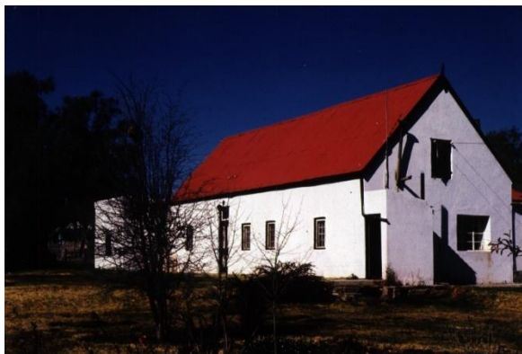
The oldest house on Elandskraal. At the back a large section was later added (the flat roof section at the back). The roof was replaced with a corrugated roof. The house was completely modernized during the 1980's