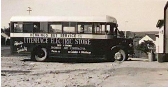
One of the busses of the Henning Bus Service of Uitenhage