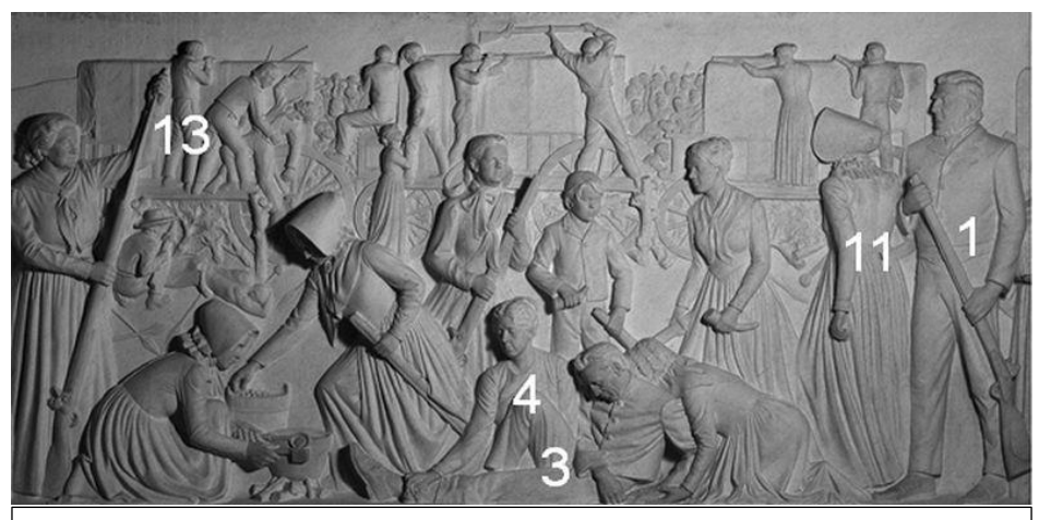
The five figures the Family League "bought", which will be described further on