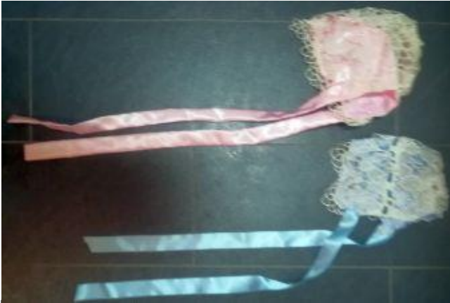
Baby girls wear the pink bonnet and baby boys the blue bonnet