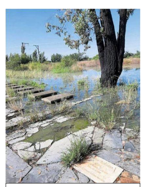
The Kroonstad Consentration Camp graveyard looked like this after being flooded by sewerage water. More than 2 000 women, children and old men (of which three were Henning children) were burried here

Unfortunately, our financial situation is currently not strong enough to make a donation. Thus, we would like