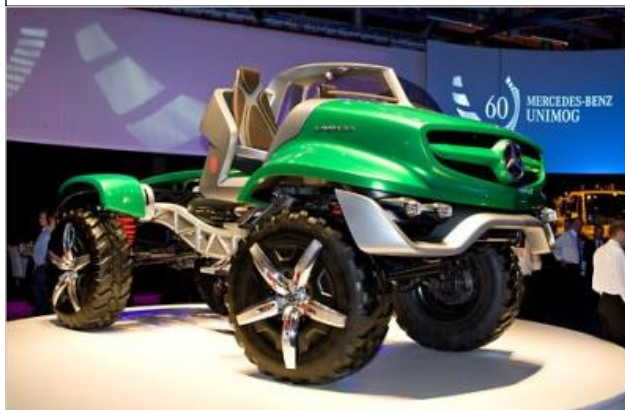
The most modern proto type Unimog

This South African produced cross-country vehicle was introduced in 1971 for the first time to the SA Defence Force. The original Unimogs were used as Ambulances, Troop Carriers and special cross-country vehicles.