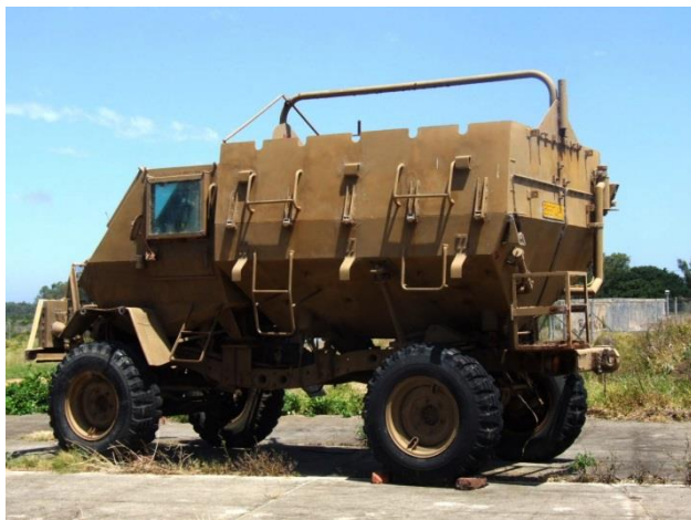
Buffel mine resistant troop carrier fitted with Unimog components