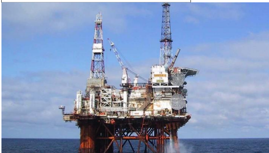
A similar platform as the one where Rev Bjarne Fowels served as chaplain over the 2018 Christmas period

The platform is stable, with long legs stretching 75 meters down to the bottom. This makes the platform stable. The oil layer is 1,5 km under the bottom of the sea. Oil and gas are pumped out, water is separated and gas and oil pumped in long pipelines to Emden in Germany or to England. This platform gets electricity by cables from Norway. Therefore, there is reduced noise on board. In fact, it is quiet. Seven platforms are linked together and we could use the long walkways to go from one platform to the