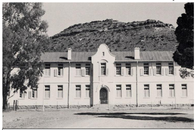
The Steynsburg Teachers Training College which was erected in 1913, where 850 teachers were trained in the following 37 years. This contributed to successful school education in Afrikaans country wide over the following 100 years

It became clear that this was not a normal CNE-school, but in fact a church school. The school commission would consist of representatives of the parents (the