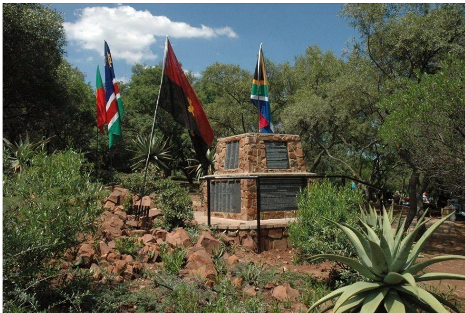
The Thirst land Trek Memorial on the terrain of he Voortrekker Monument, Pretoria during the inauguration ceremony on 19 March 2016