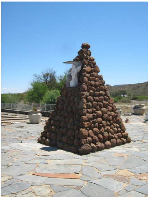
The rebuilt rock-packing the women who were confined in the Bethulie Concentration Camp erected after the war, with a replica of the angel statue. The funds for the mould were donated by the Henning Family League