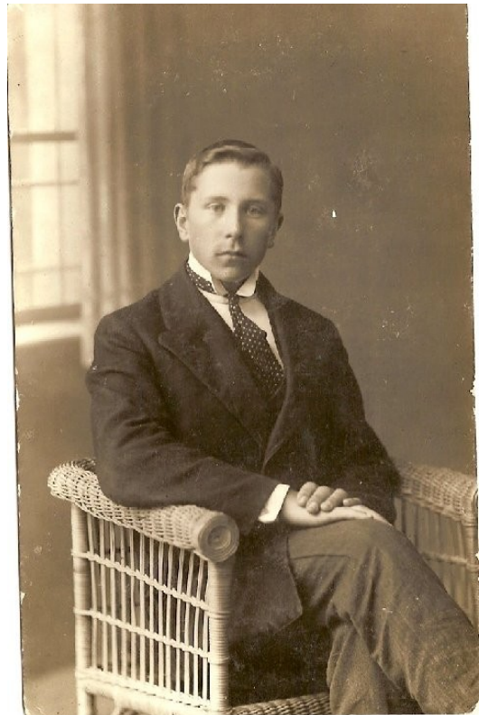
Aleksander Henning * 1897