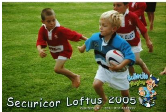
Securicor Loftus 2005